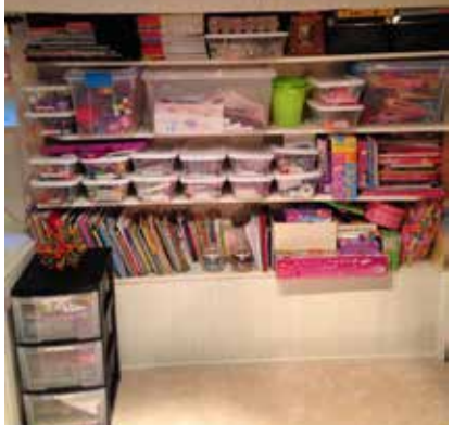
Tidy play room for triplets!