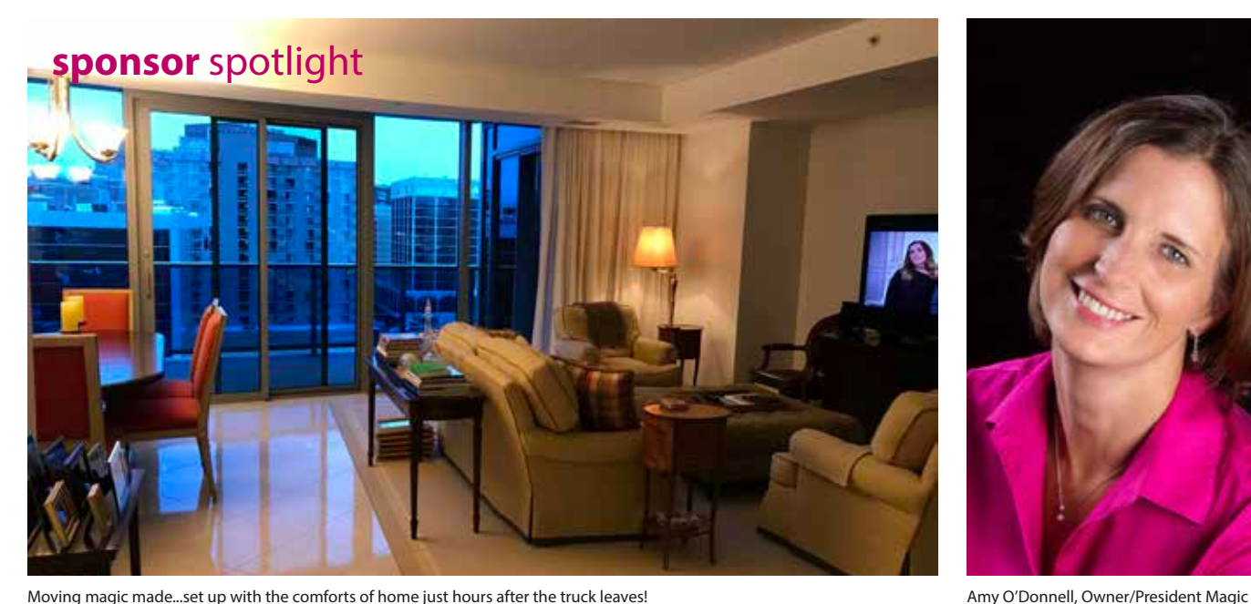
Noving magic made...set up with the comforts of home just hours after the truck leaves!